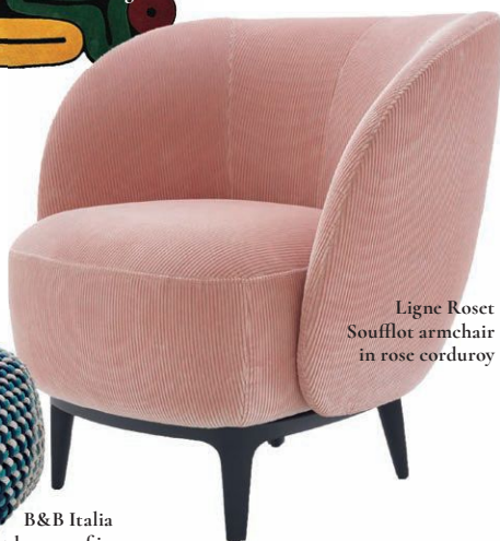
Ligne Roset Soufflot armchair in rose corduroy