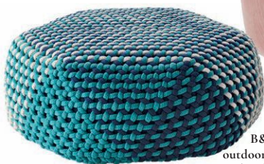
B&B Italia outdoor pouf in Night Blu, WPA Chicago