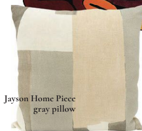
Jayson Home Piece gray pillow